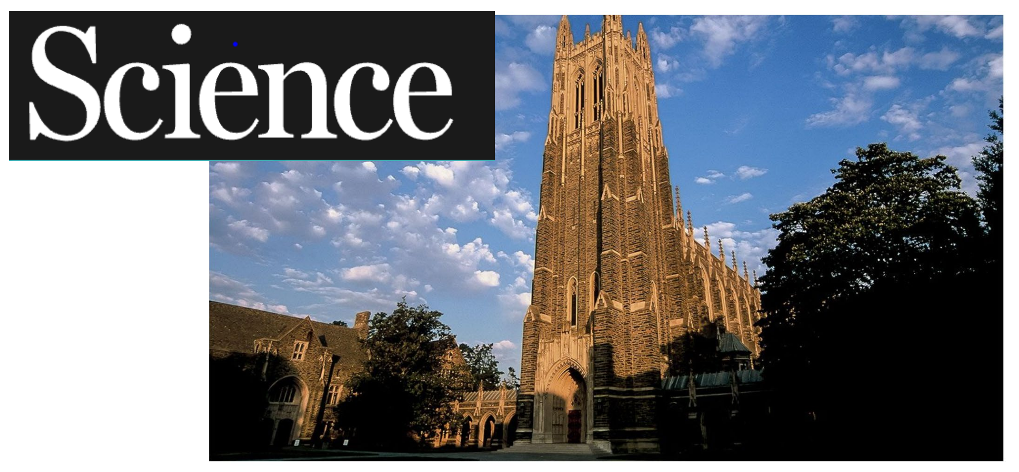
Duke University is at the center of a whistleblower lawsuit concerning potential research misconduct.